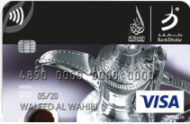
Visa Infinite Card